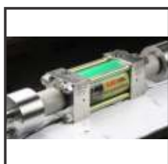
ERTI 50Hp Intensifier