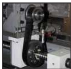
Smart Ball Screw