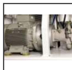
Siemens Oil Pump