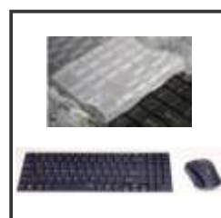
Keyboard & Cover