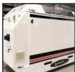
High Pressure Pump System