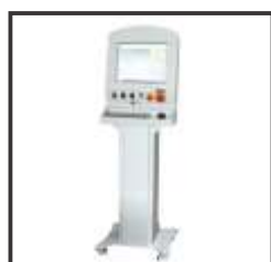
CNC Control System