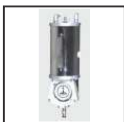
Numeric Abrasive Doser