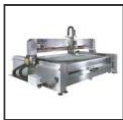
CNC Cutting Platform